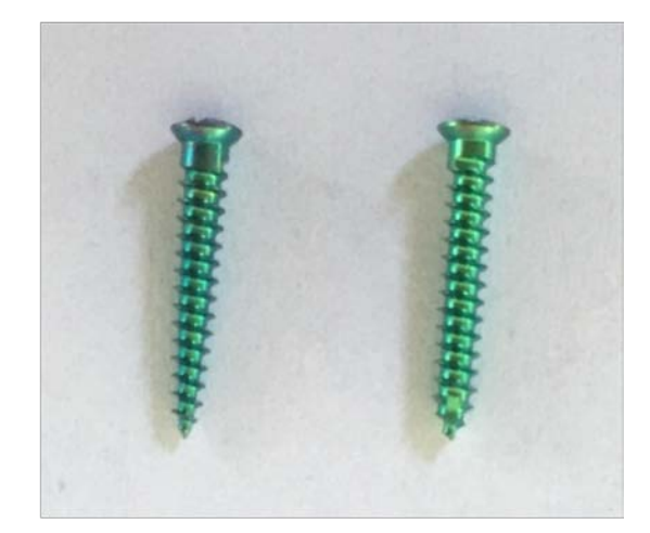
Figure 1. Cylindrical (right) and tapered (left) miniimplants.

General inflammation signs, including swelling,