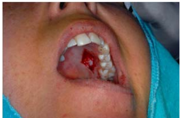
Figure 2. Image of the donor site after surgery.

After a gingival graft was taken from the palate, the donor site was irrigated with sterile saline, and hemostasis was achieved with gauze moistened in saline. Later, 4 different covering techniques were applied over the donor site to protect the surgical region. In group A, the donor site was covered with periodontal dressing (Coe-Pak, GC America, Alsip, IL) (Figure 3A). An Essix retainer was adapted to