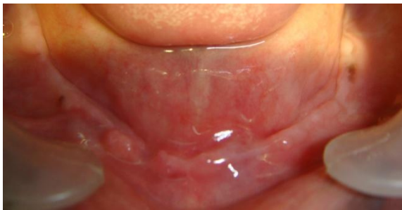
Figure 1. Initial atrophic jaw.

In the anterior mandibular region it is rare to find a lingual undercut but it might be a finding which can be a problem during implant placement. The use of conventional or computed tomography (CT) is usually advocated for pre-operative implant planning because a cross-sectional view provides a proper visualization of the anatomy of the surgical site. 7 American Academy of Oral and Maxillofacial Radiology (AAOMR) has recommended the inclusion of cross-sectional imaging to evaluate any potential implant site prior to its placement. In fact, the paper also admits that there is no evidence to support this statement because the indiscriminate use of dental imaging, especially conventional and CT, can be potentially harmful to the patient when the cost and radiation doses are considered. 8