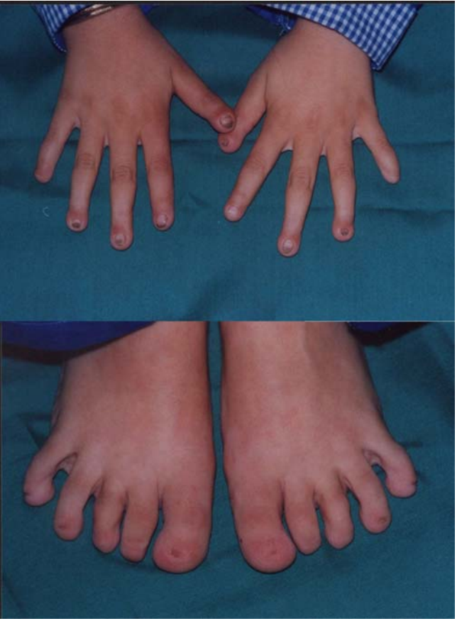
Figure 3. Striking malformation of the hands and feet were found. The patient had malformed nails; the first finger of the left hand as well as the second and the third fingers on both feet had no nails.

a few inflammatory cells. The results of gingivectomy were better esthetic appearance and speech as well as