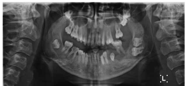
Figure 3. Panoramic radiograph of the patient showing generalized bone loss that was severe in the left first molars.

ies in the mouth. The patient was under regular follow-up visits. The treatment outcomes after six months were satisfactory and no symptoms of recurrence were observed (Figures 1 to 4).