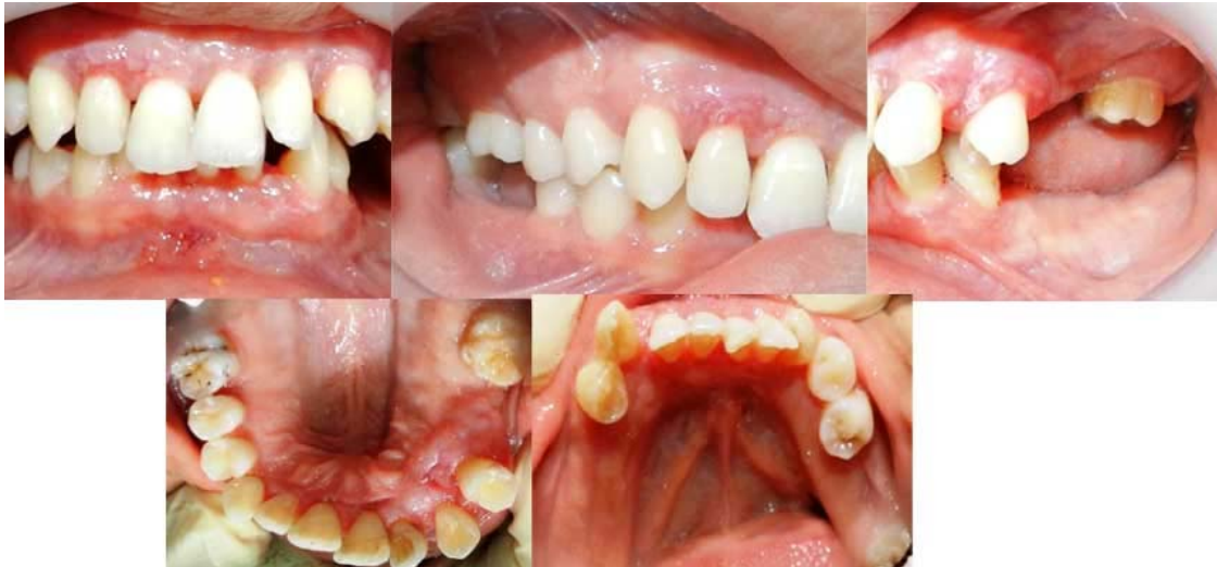
Figure 4. The treatment outcomes after six months were satisfactory and no symptoms of recurrence were observed.