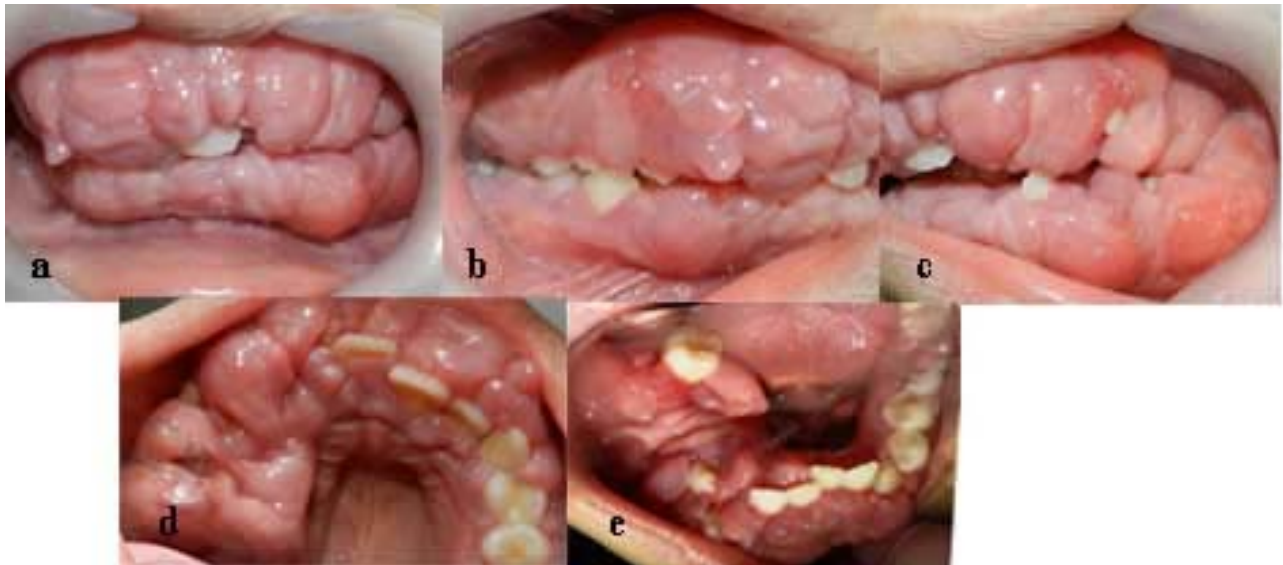
Figure 2. Intraoral views of the patient: A) frontal views; B) lateral view (right side); C) lateral view (left side); D) upper occlusal view; E) lower occlusal view.

vere than on the right side. In the radiographic view generalized bone loss was observed that was severe in the left first molars that indicated the probability of aggressive periodontitis along with gingival enlargement. In addition, the left second molars were unerupted (Figure 3). Hematologic evaluation of the patient was normal. In histological evaluation of lesions, an increase in connective tissue with condensed collagen fibers along with light infiltration with persistent inflamed cells was seen. Based on clinical and histological findings, and medical and family history of the patient, HGF was diagnosed. Treatment included surgery (internal and external gingivectomy) in six sessions, with prescription of antibiotic and 0.2% chlorhexidine mouthwash. Moreover, gingivoplasty was performed in the esthetic zone of maxilla after performing all the surger-