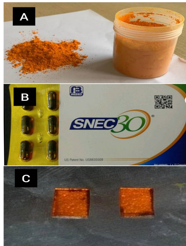
Figure 1. Test drug agents (a) pure nano-curcumin, (b) SNEC, and (c) 1% SNEC in HPMC

The stock solution of the test drugs was prepared by dissolving it in dimethylsulfoxide to ensure good solubilization. For the MIC assay, nine serial dilutions of each drug solution were formulated in thioglycollate broth to obtain the following concentrations: 100, 50, 25, 12.5, 6.25, 3.12, 1.6, 0.8, 0.4, and 0.2 µg/mL. From the maintained stock cultures of required organisms, 5 µL was taken and added to 2 mL of thioglycollate broth. In each of the 10 tubes of each drug solution, 200 µL of the above culture suspension of a particular pathogen was