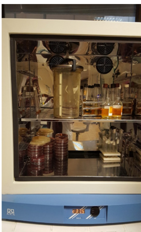
Figure 1. Placing the anaerobic jar in the incubator at 37 °C

Pair-wise comparisons of mean values for the inhibition zone diameter by the Tukey test revealed almost comparable values in all the groups with different concentrations of the extract and 0.2% CHX, except for the concentrations of 2.5 and 5 mg/mL of the extract, which was significantly less than 0.2% CHX ( P < 0.05 ).