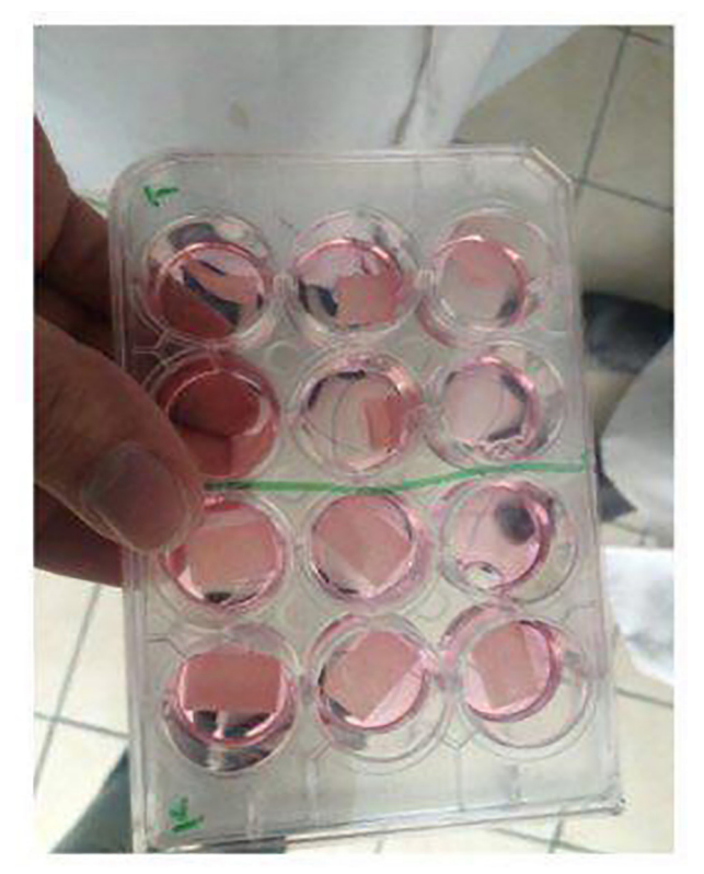
Figure 1. ADM adapted to the bottom of wells.

Three plates were used for the assessment of cell viability using the MTT assay, and two plates were used for the assessment of cell attachment using 4,6-diamidino-2-phenylindole (DAPI) and methyl-thiazol-diphenyl-tetrazolium (MTT) assay.