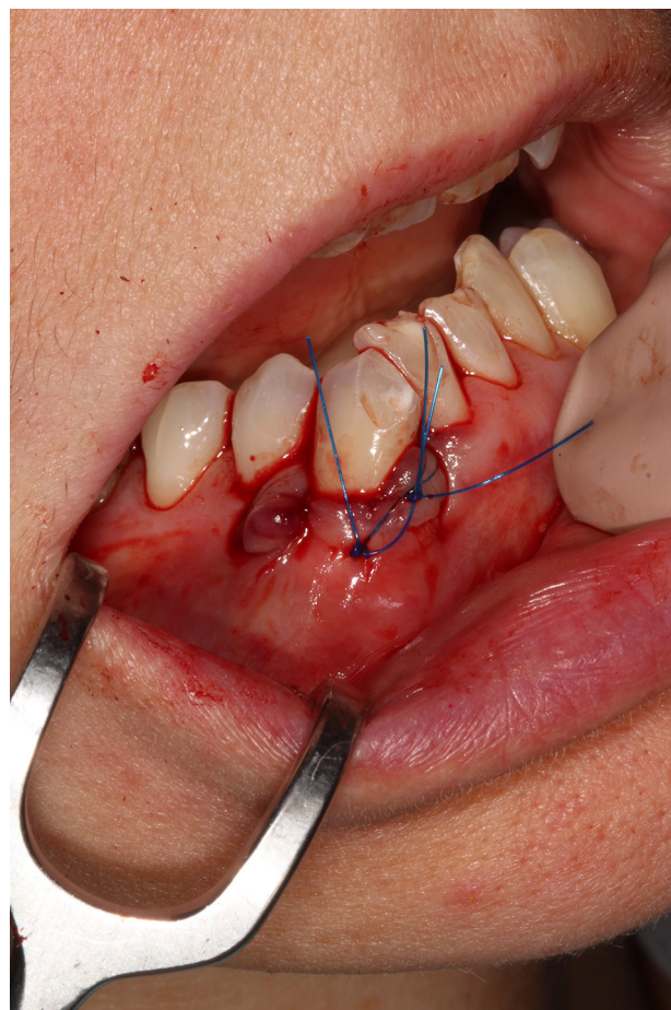
Figure 4. Suturing after the CTG has been positioned inside the tunnel. Please note the sutures were kept longer to prevent poking of the suture ends into the lower lip and buccal mucosa.

to have the patient come back for routine check-ups or long-term follow-ups. This implies that one can only speculate about the long-term success of root coverage in this case. However, evidence suggests that creeping attachment and improvement in root coverage are typically observed in cases where CTG is used for root coverage. 22-26