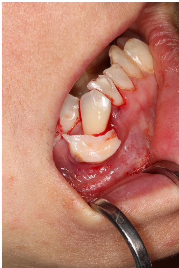
Figure 3. The harvested CTG positioned on the exposed root surface to check its dimensions prior to placement inside the tunnel on the buccal aspect of tooth 43.