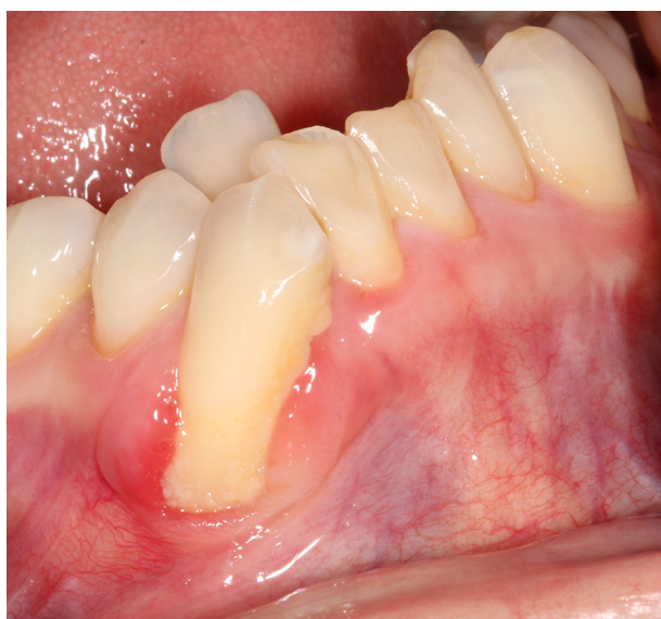
Figure 1. At the time of initial consultation, prior to periodontal therapy.

A 42-year-old Caucasian female with no significant medical history was seen at our periodontal practice for severe dental hypersensitivity at tooth #43 and extraction of nonrestorable tooth #42 (Figure 1 – at the time of initial consultation). The patient was referred from a distant area. This limited our capacity to follow up the patient for a longer period. At the initial examination, orthodontic and prosthodontic consultation was recommended to improve malocclusion and bring tooth #43 inside the alveolar housing for rehabilitation and restoration of the occlusal wear. However, the patient refused