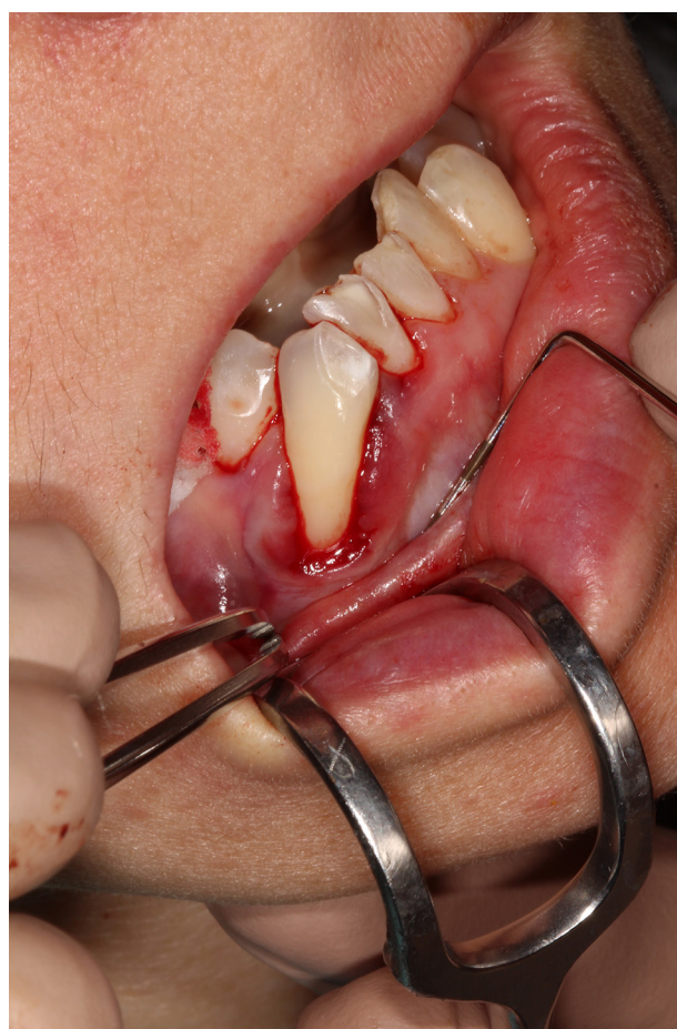
Figure 2. Final tunnel preparation prior to the placement of CTG The harvested CTG positioned on the exposed root surface to check its dimensions prior to placement.

A significant limitation of our study, as with any case report, is the sample size. Although case reports, along with professional opinion, only form the base in the hierarchy of evidence-based practice, they do provide the proof of principle and help steer clinicians towards some clinical guidelines in rare or particularly challenging cases. This is evident in our study as we report a case where the severe gingival recession was further complicated by the shape of the defect (U-shaped), height and width of recession (5 mm), thin biotype, lack of keratinized tissue, shallow vestibular depth and location of the tooth out of alveolar housing. Another limitation of the study is the short follow-up of five weeks and follow-up by phone call at three months. Ideally, we would have liked to follow the patient for at least six months. However, given the vast Canadian expanse and a limited number of specialists, we often see patients who are referred from distant areas. That is why, despite our best efforts, it is not always possible