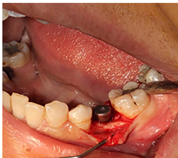
Figure 1. The healing abutment is placed after implant placement (one-stage surgery).

The inclusion criteria of the patients consisted of no systemic disease, no pregnancy, no smoking, and the presence of suitable soft and hard tissue without the need for hard and soft tissue augmentation, presence of a posterior single-tooth vacancy, an interest in implant treatment, absence of periodontal diseases,