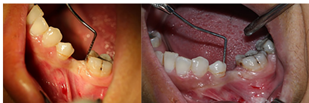
Figure 2. Measurement of dental papilla height in the mesial and distal aspects before surgery.

proper oral hygiene, no pocket depths >3 mm, no bone loss, a safe distance from the adjacent tooth (at least 1.5 mm), thick gingival biotype, no history of radiotherapy and chemotherapy. The exclusion criteria consisted of uncontrolled active systemic disease, the need for bone grafts (GBR), thin gingival biotype, and prolonged steroid therapy.