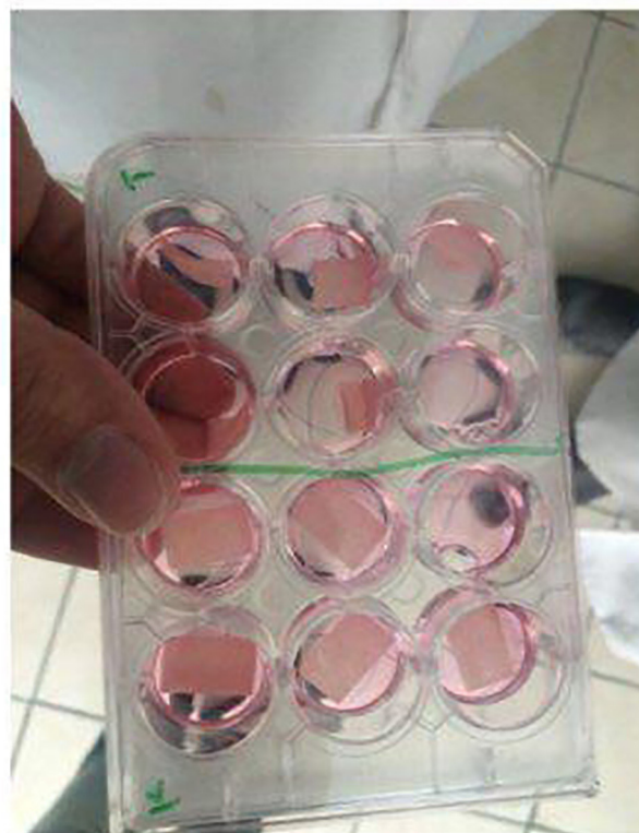
Figure 1. ADM adapted to the bottom of wells.

Three plates were used for the assessment of cell viability using the MTT assay, and two plates were used for the assessment of cell attachment using 4',6-diamidino-2-phenylindole (DAPI) and